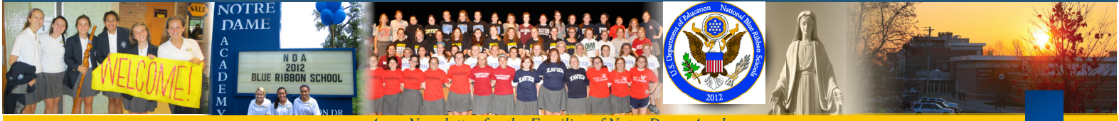
An e-Newsletter for the Families of Notre Dame Academy